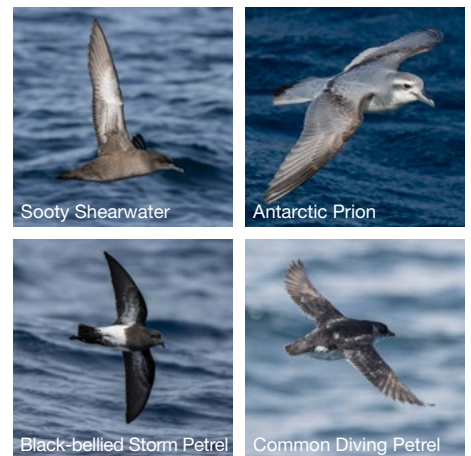
Shearwaters and petrels (including diving petrels, storm petrels and prions) are particularly susceptible to vessel strikes.